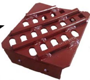
Maximum Thresh Box Part No.: SBM0540B