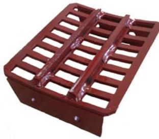
Standard Thresh Box Part No.: SBM0540C