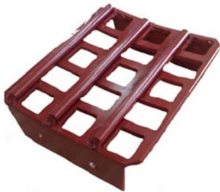
Round Bar Thresh Box Part No.: SBM0540D