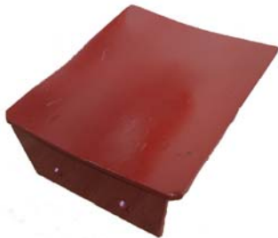
Minimum Thresh Box Part No.: SBM0540A